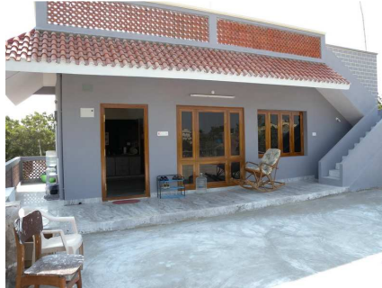
My new apartment.