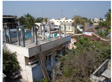
View of Chirala from the roof